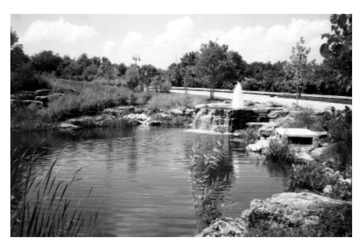
Water Features at City Hall

Baxter Crossings Apartments City of Chesterfield City Hall Westmont Apartments